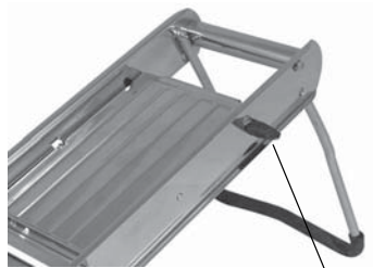
Guide Plate Knob